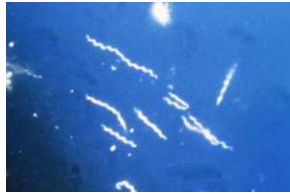
B.b. highly magnified

Lyme disease, also known as Lyme borreliosis, is an infectious disease caused by the bacterium Borrelia burgdorferi . The disease is classified by the World Health Organisation as an infectious or parasitic disease. Borrelia burgdorferi belongs to the bacterial genus 'Borrelia'. Borrelia are members of a larger family of spiral-shaped bacteria called Spirochaetes.