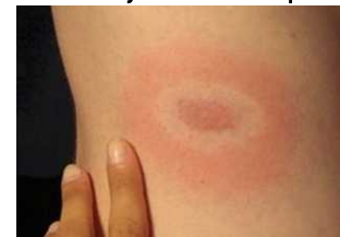
Erythema migrans rash

Lyme disease can affect any part of the body and cause many different symptoms. The commonest symptoms relate to the person feeling unwell, having flu-like symptoms, extreme tiredness, muscle pain, muscle weakness, joint pain, upset digestive system, headache, facial palsy, meningitis-like symptoms, disturbances of the central nervous system and a poor sleep pattern. In some cases a characteristic, expanding 'bull's eye' rash appears on the skin. This rash is called erythema migrans or EM. UK figures suggest around 40% of cases see the rash. The symptoms known to be associated with Lyme disease are many and diverse, and can vary from mild to very severe. Symptom patterns vary from person to person, and patients may have few or many symptoms.